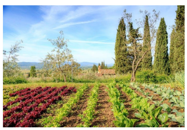
Fattoria la Vialle, Tuscany

In the morning, we leave the Casentino for Umbria. One the way, we stop at Fattoria la Vialla, a family-run agricultural business, one of the oldest and largest organic-biodynamic farms in Chianti. In 2016, they received more than 300 awards for their wines, olive oil, and other products. We will spend most of the day there, grounding ourselves in the earth and appreciating its many gifts with a guided tour and special lunch.